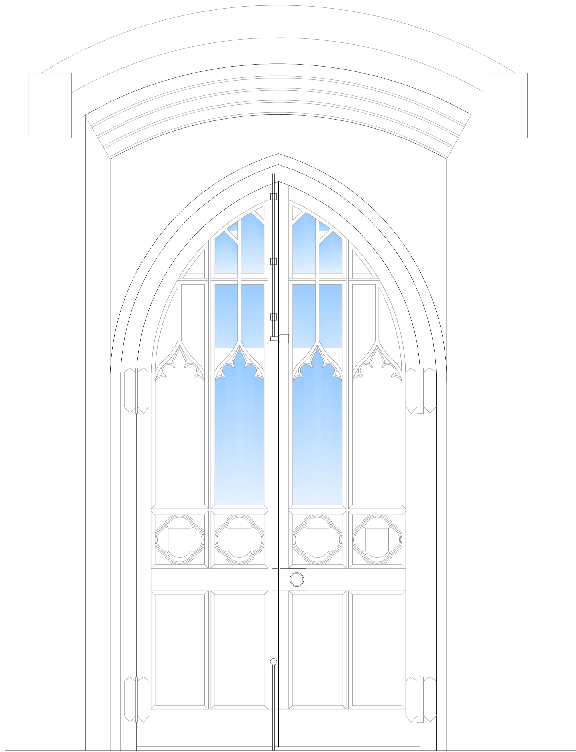
1:10 INTERNAL ELEVATION TO INNER SOUTH DOOR (proposed)